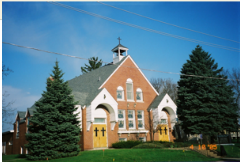
Millburn Congregational Church is celebrating its 175th anniversary in 2015. The church in 1907 (left) and (right) today.

Martin’s General Store Museum, 38757 N. US Highway 45, Old Mill Creek, IL 60046