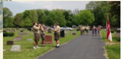
Local veterans and scout groups help commemorate Memorial Day at Millburn Cemetery in 2014. This year's ceremony takes place Monday, May 25 at 2:00 p.m.

Mark your calendars. The Memorial Day Service at Millburn Cemetery is scheduled for Monday, May 25, 2015, at 2:00 PM. Bring a lawn chair if you'd like to sit, and flowers to place on veterans' graves. Cookies and lemonade will be provided after the service.