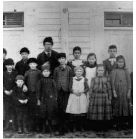
Dodge School (about 1890)

Read inside this newsletter about how Millburn Consolidated Community School District 24 was formed from Hockaday, Dodge, Grubb, Waterbury, and Browe Schools almost a century ago.