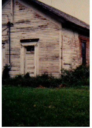
Grubb School (as it existed in 1966)