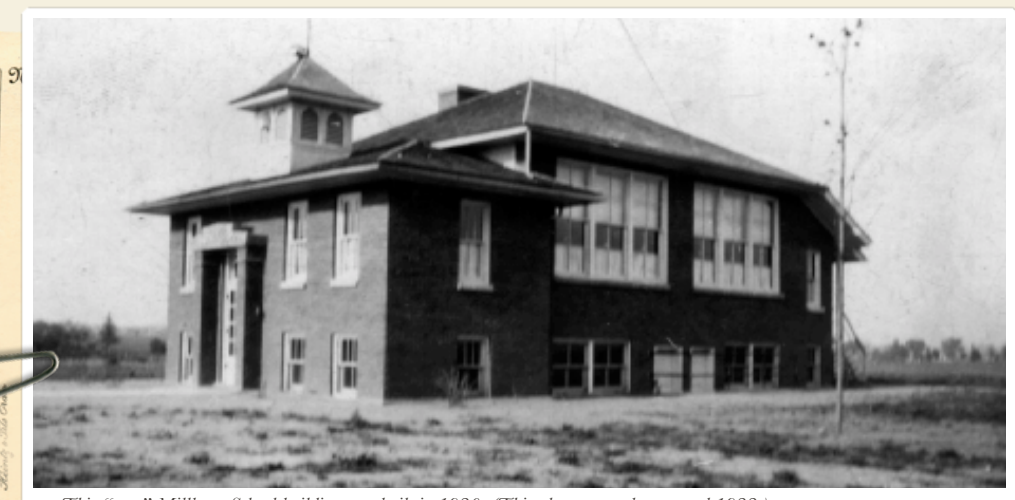
This "new" Millburn School building was built in 1920. (This photo was taken around 1922.)

In the early 1960s, the Millburn School building was built at the northwest corner of Crawford and Millburn Roads. In 1965, there were about 100 students and a graduating class of nine. In 1999, there were over 725 students. In the fall of 2005, Millburn opened a second campus, north of Grass Lake Road and west of Highway 45. In 2012, the Illinois School Report Card listed the total enrollment for Millburn C. C. School District 24 in Old Mill Creek (and Lindenhurst) at 1541 students.