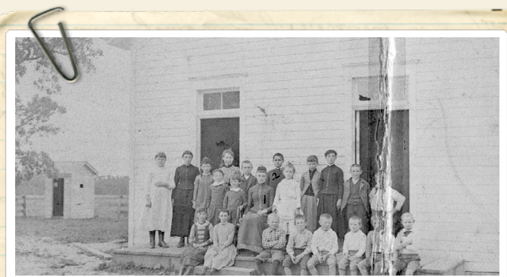
Hockaday School (Photo, 1887)

Mark your calendars. The Memorial Day Service at Millburn Cemetery is scheduled for Monday, May 27, 2013, at 2:00 PM. Bring a lawn chair, if needed, and flowers to place on veterans' graves. Cookies and lemonade will be provided after the service.