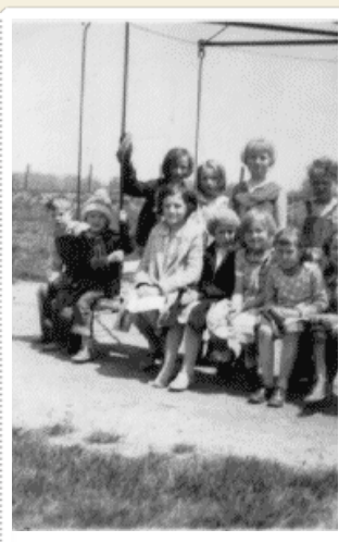
School Playground 1935