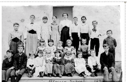
Browe School (1894)